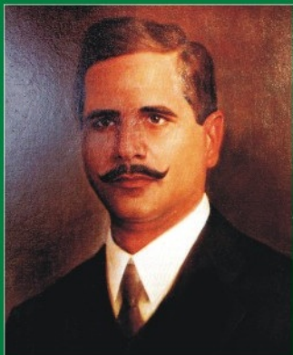
Allama Muhammad Iqbal

Address to Civil Naval, Military and Air force Officers of Pakistan Government. Karachi October 11, 1947